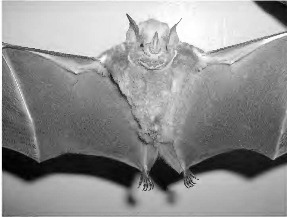
Figure 2. Photograph of live female Stenoderma rufum captured on St. Croix, 10 June 2004.

set along the length of the top of reservoir dam. A second mist net was set perpendicular to the dam, parallel to and between the reservoir and Creque Dam Road. The third net was set approximately 50 m east (upstream) of the reservoir, in the ghat leading to the reservoir, and at a location known as the "swimming hole." The locality is identified as: St. Croix; Frederiksted District; Northside A; Creque Reservoir; 0.25 km south, 0.1 km east Frenchman Hill; 17°44'45"N, 64°52'32"W. Elevation of the netting site ranged from about 65 m (dam) to 100 m (swimming hole).